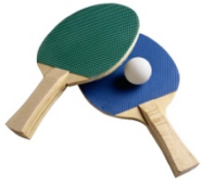
Table Tennis - two tables now available

TABLE TENNIS EVENINGS in the Pavilion at Great Mead on