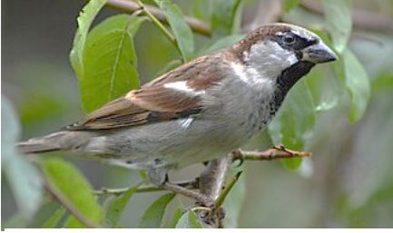
House Sparrow